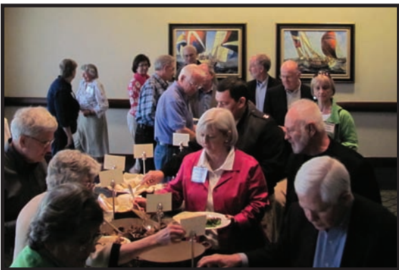
A group of reunion attendees at lunch